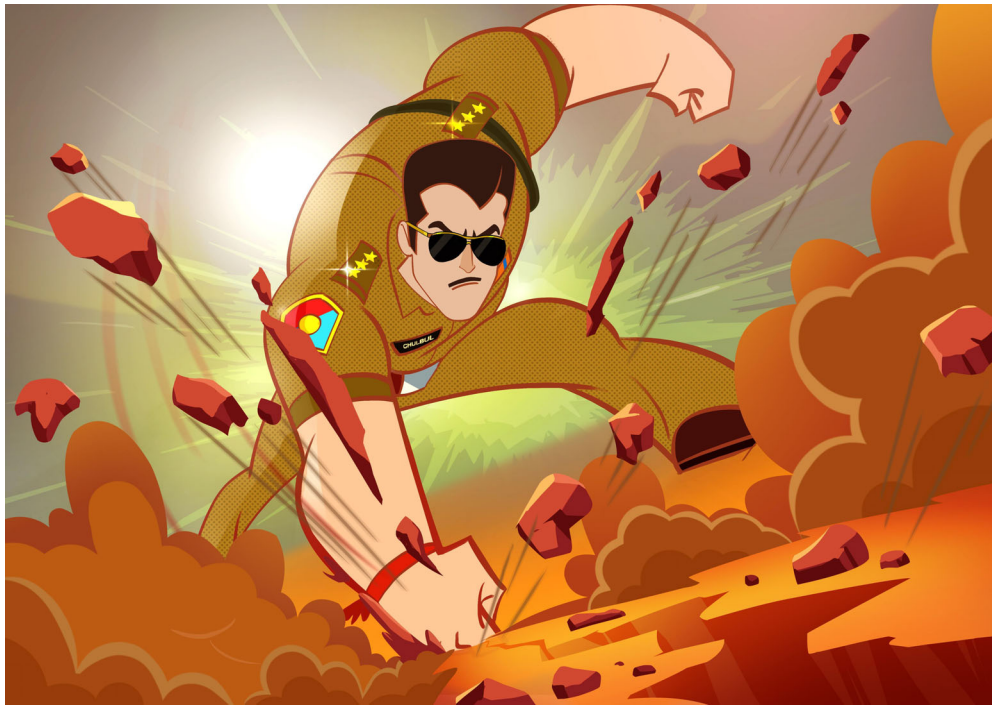
"Dabangg Cosmos Maya"

Debuting summer 2021 on Disney Plus Hotstar, the series will be available to its subscriber base of eight million. Jamie Lang